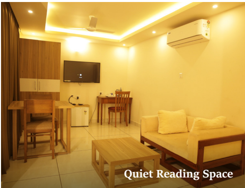
Quiet Reading Space