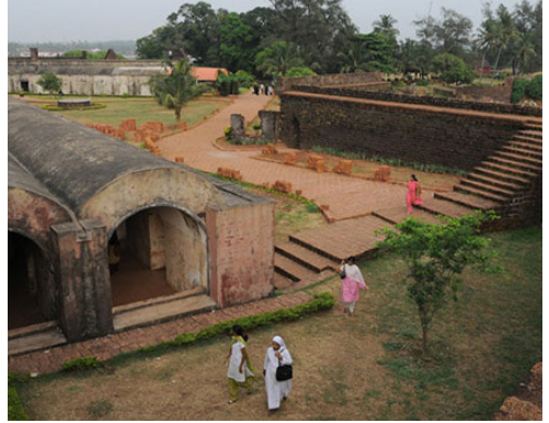
St Angelo's Fort, about 3 Km