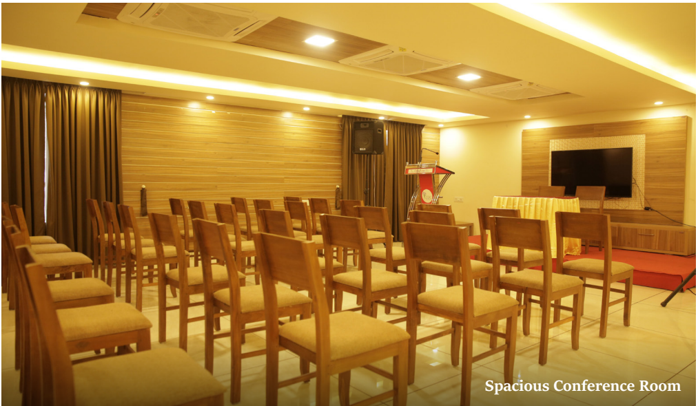
Spacious Conference Room