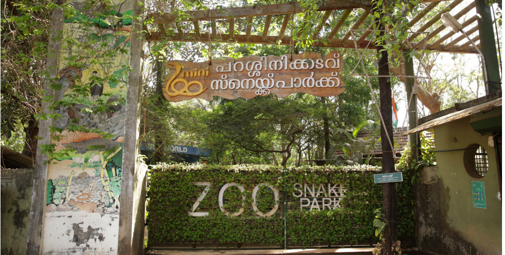
Parassinikadavu Snake Park, about 16 Km