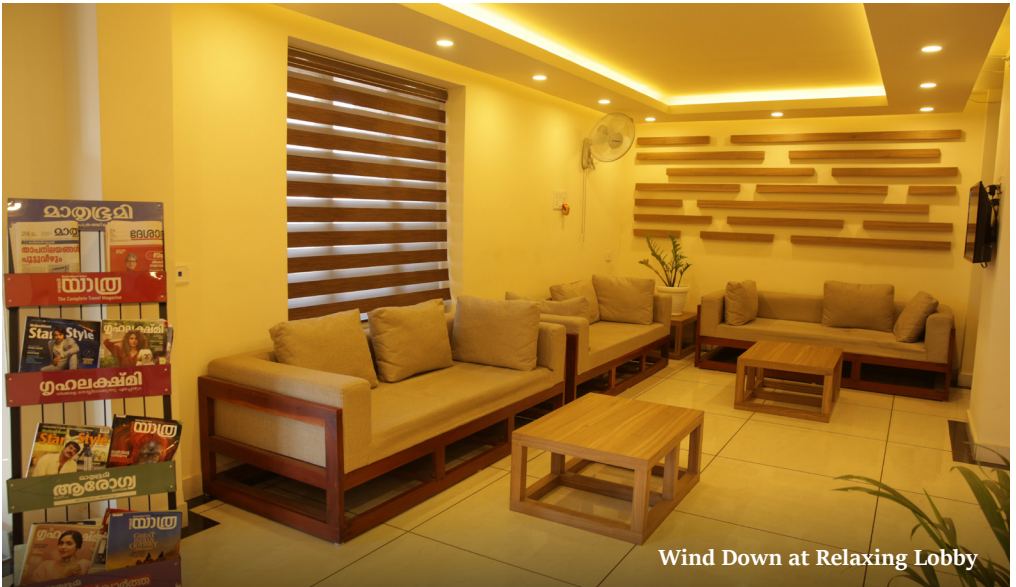
Wind Down at Relaxing Lobby