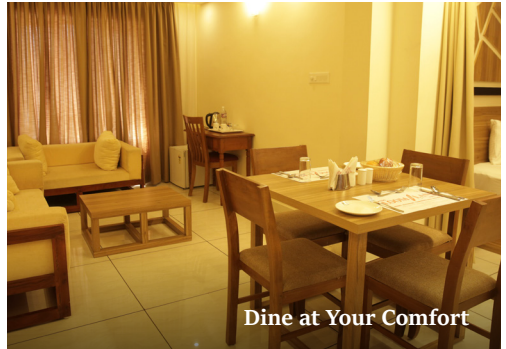
Dine at Your Comfort