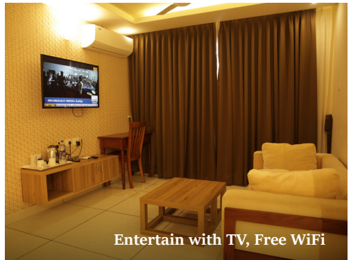
Entertain with TV, Free WiFi