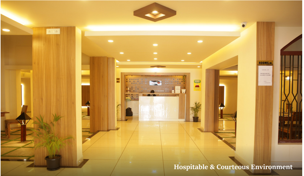
Hospitable & Courteous Environment