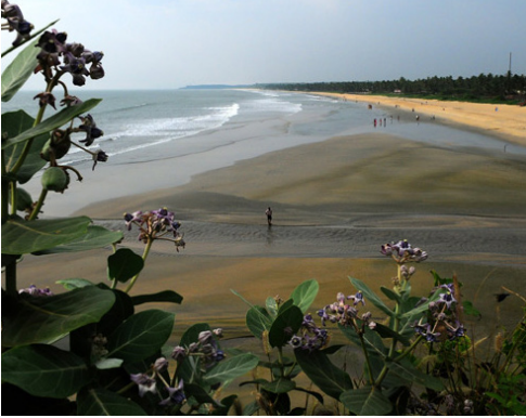
Payyambalam Beach, about 3 Km