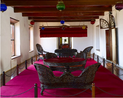
Arakkal Museum, about 3.5 Km