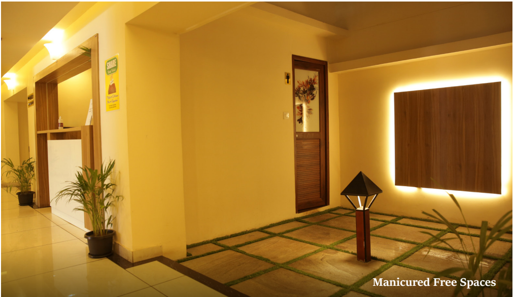
Manicured Free Spaces