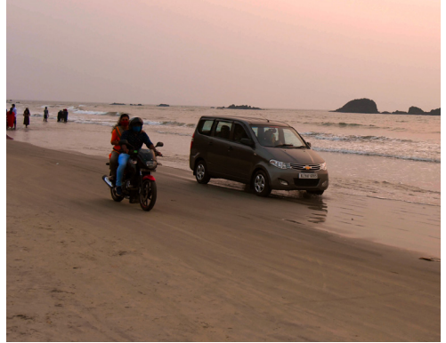
Muzhappilangad Drive-in Beach, about 15 Km