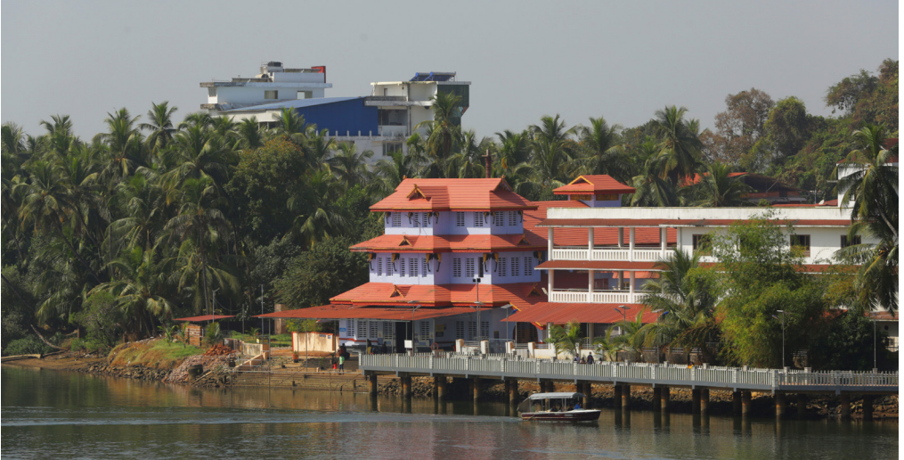
Parassinikadavu Temple, about 18 km